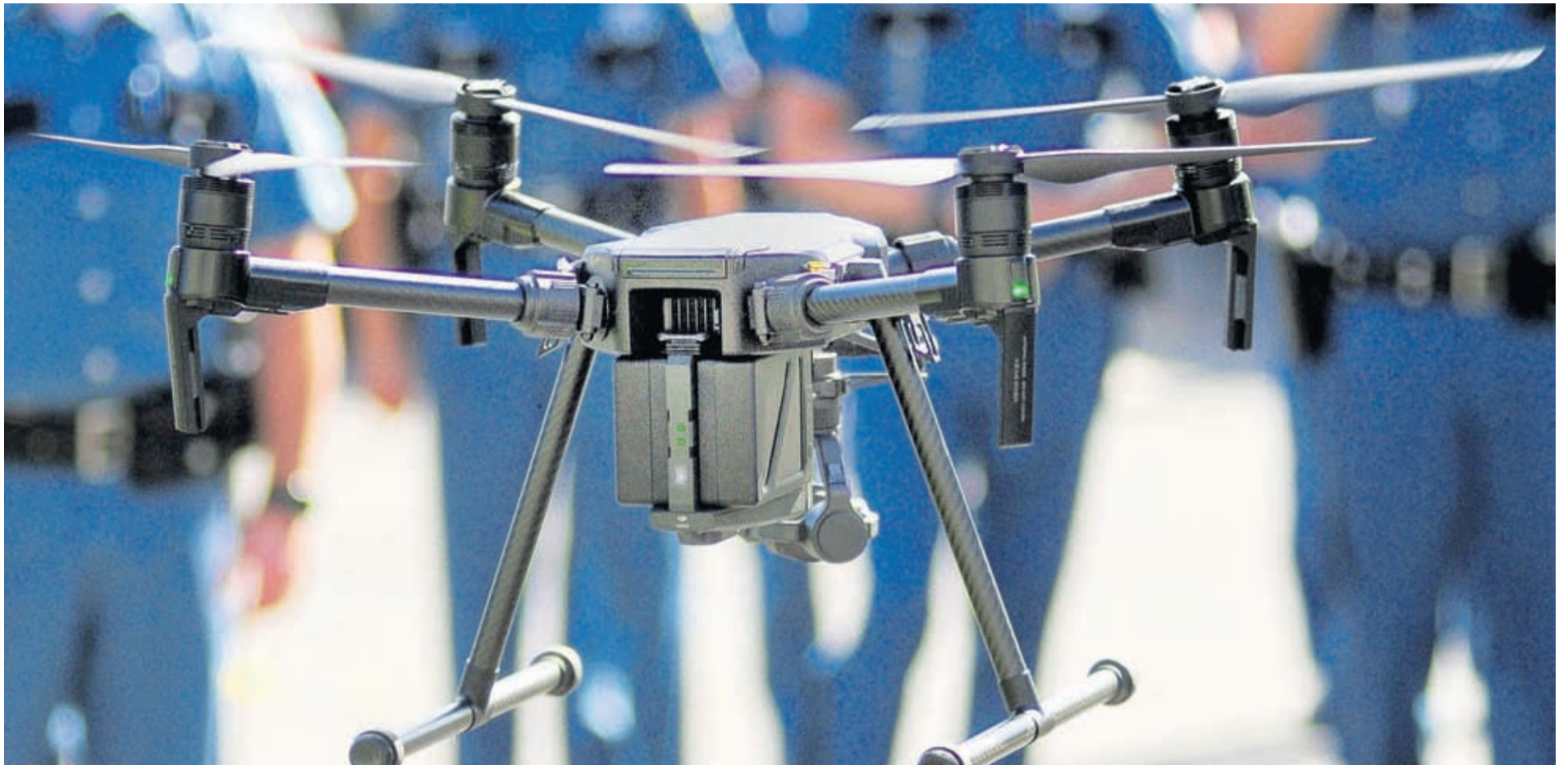
In a Thursday Sept. 28, 2017 file photo, a Maine State Police unmanned aerial vehicle hovers outside Maine State Police headquarters at the Central Maine Commerce Center in Augusta, Me.